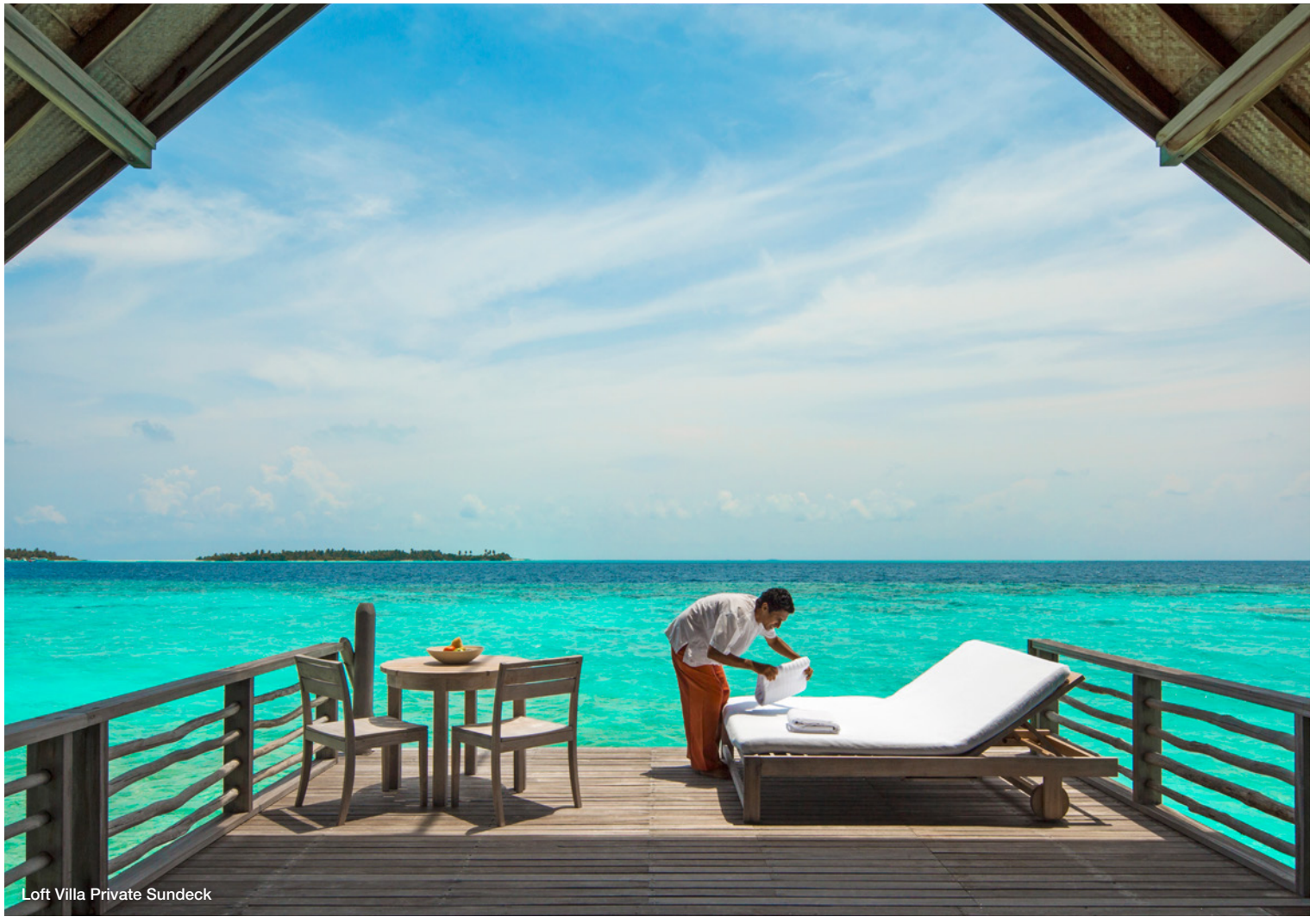
Loft Villa Private Sundeck