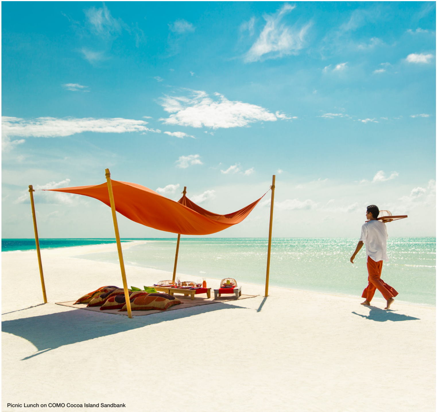
Picnic Lunch on COMO Cocoa Island Sandbank