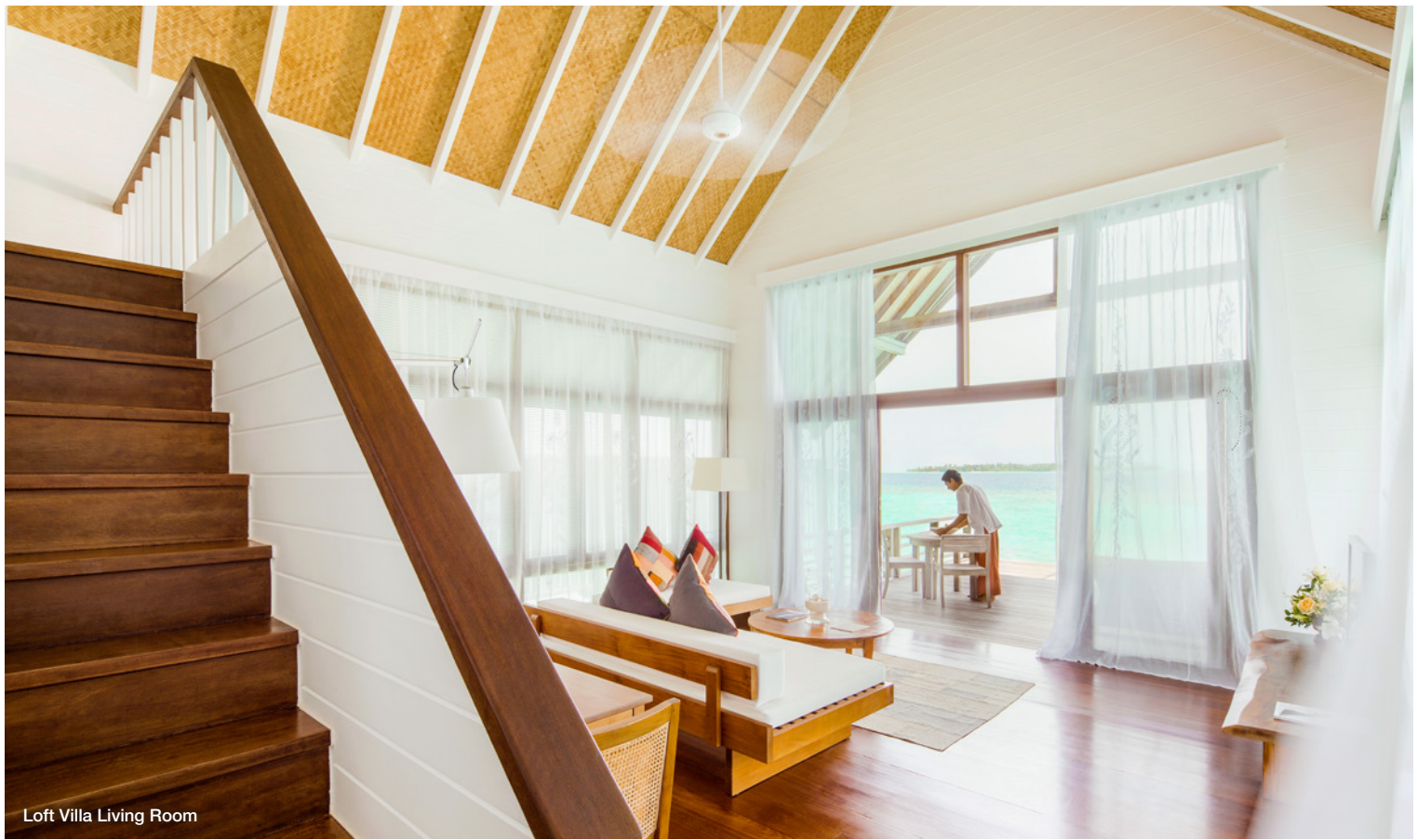
Loft Villa Living Room