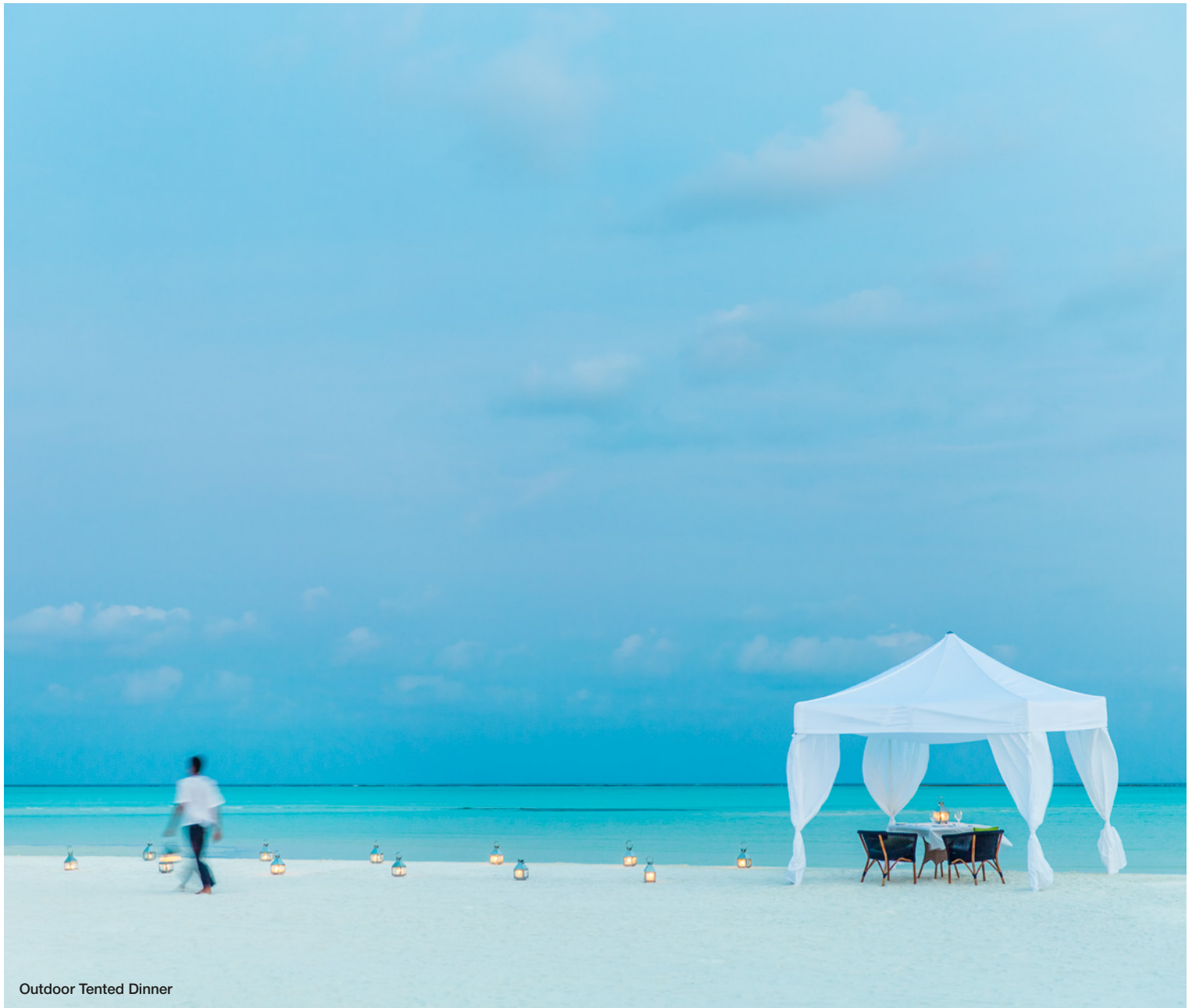
Outdoor Tented Dinner