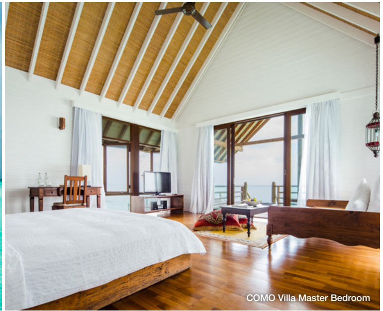
COMO Villa Master Bedroom