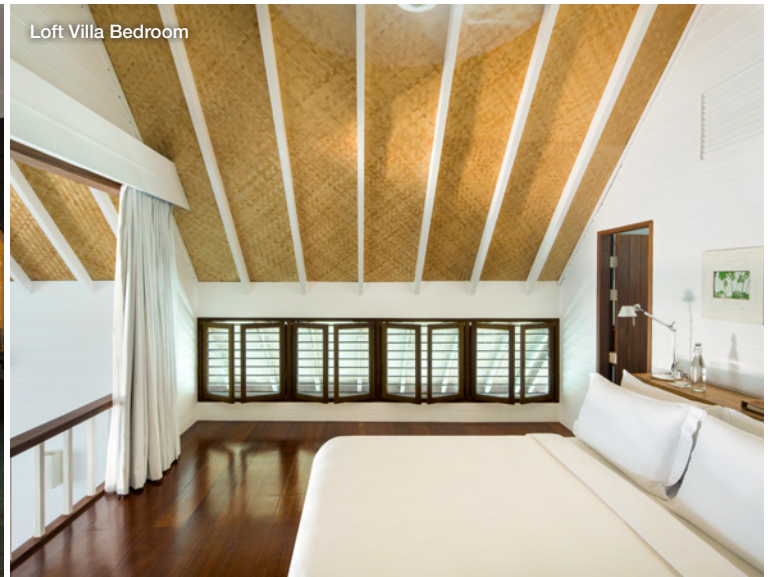
Loft Villa Bedroom