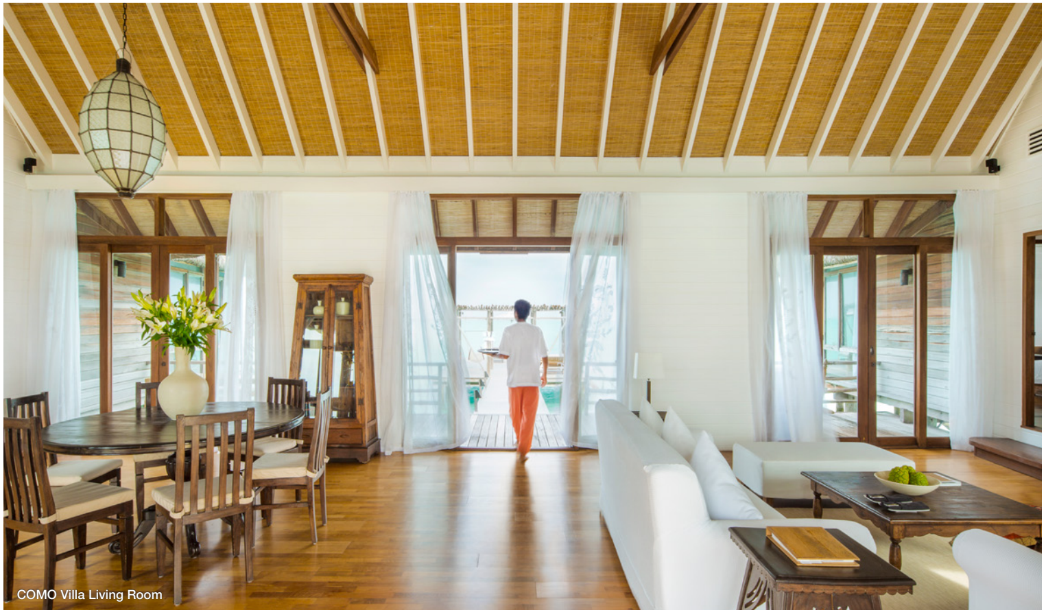
COMO Villa Living Room