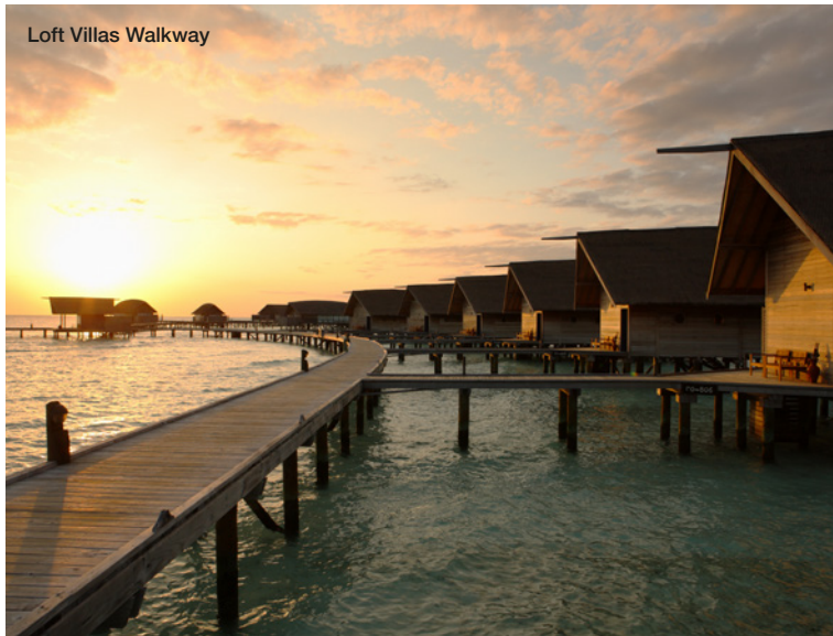
Loft Villas Walkway